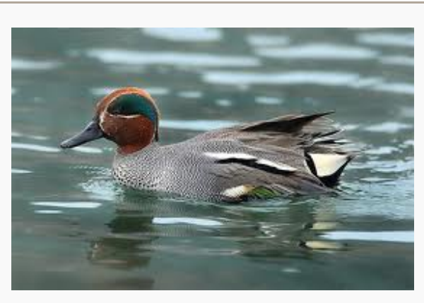
The Common Teal

The quantity of birds susceptible to infection is calculated by determining the density of susceptible birds along the flying route. The time of journey for the susceptible birds is the distance between each patch divided by their mean flight